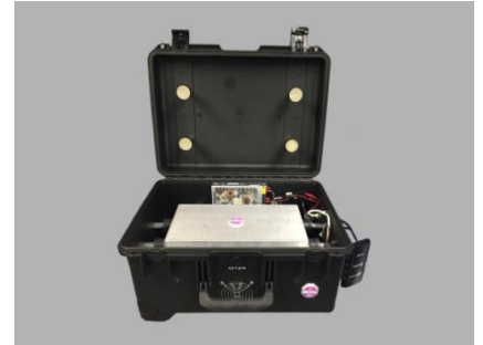
LaserSense-ML Analyzer in Pelican Case