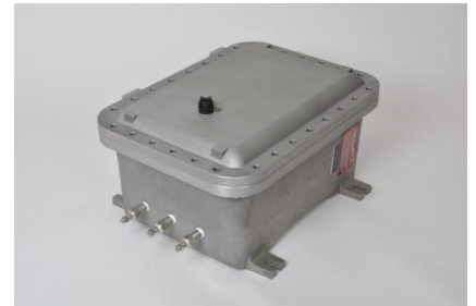
Available in NEMA 4x and Explosion-Proof Housings